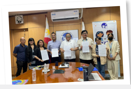
Attendees of the MOU signing

We signed new MOUs in Thailand and the Philippines to battle the growing problem of online child exploitation. In Thailand, our team also conducted anti-OSEC training for government agents, police and other non-governmental organizations (NGOs)!