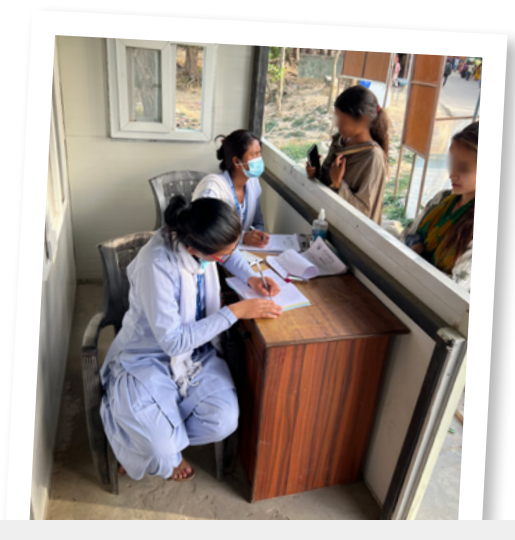
Destiny Rescue agents (blue uniforms) at work in Nepal

Partnership in Nepal has led to some of our most effective work to date. Officials treat us as a valued asset, working with us to conduct raids, follow up on tips and investigate traffickers, all while their border agents support our border stations.