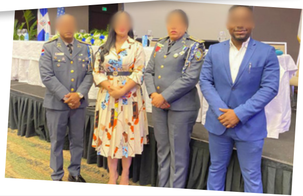
Destiny Rescue Dominican Republic agents work alongside the Dominican Republic National Police