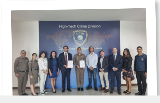
Attendees during the MOU signing between Destiny Rescue and the Thai government

Collaboration has already begun. Destiny Rescue's Global OSEC Rescue Director led a productive training workshop with Thailand's anti-trafficking division earlier this year. The unit commander was so pleased with the training that he directly requested further support from Destiny Rescue.